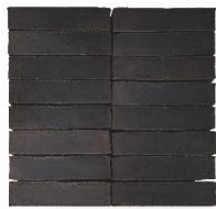
EW0449 Kul LESS

The illustrated products below are examples of products covered by this EPD.