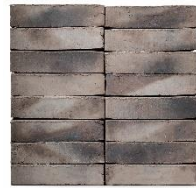
EW0451 Stål LESS