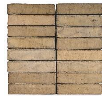
EW0476 Eg LESS