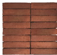
EW0465 Rød nuanceret

The illustrated products below are examples of products covered by this EPD.