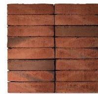
EW0409 Valmue LESS