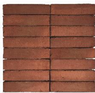
EW0465 Rød nuanceret LESS

The illustrated products below are examples of products covered by this EPD.