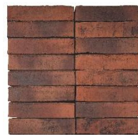
EW0466 Kobber LESS