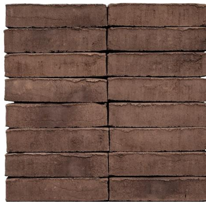
EW0477 Mahogni LESS

The illustrated product below is an example of a product covered by this EPD.