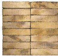
EW0470 Messing LESS

Product illustrations: The illustrated products below are examples of products covered by this EPD.