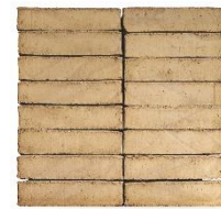
EW0479 Sand LESS