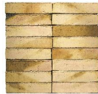
EW0491 Magma LESS