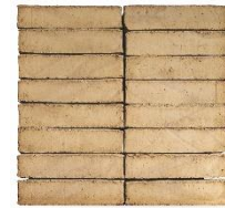
EW0479 Sand LESS