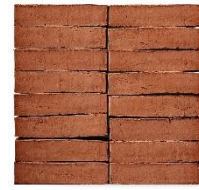
EW2207 Rød Mørk